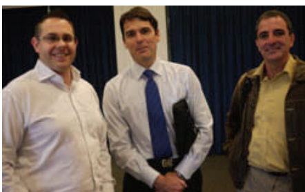
CAUTHE research engagement forum, August 2011