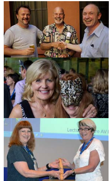
Top to bottom: Informal dinner, Conference dinner, Closing ceremony