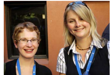
Top to bottom: Morning tea, Workshop session, Evening sun-downer