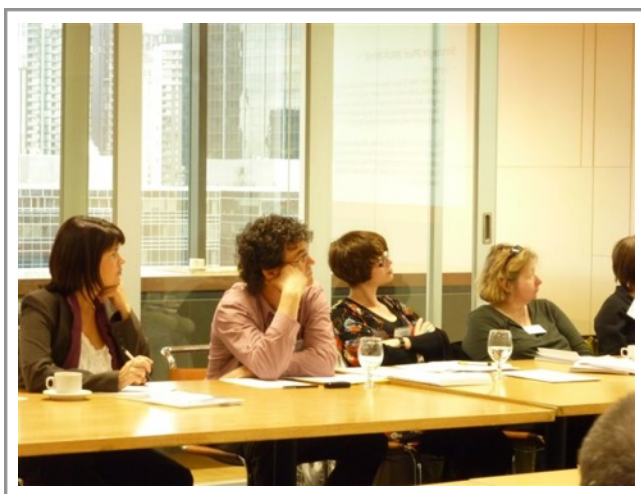
Members attending the MYM

Most of the discussion was concerned with membership and voting rights. Members agreed that CAUTHE had flourished as an organisation but recognised that it needed to simplify and bring its constitution into line with current practices. It was also identified that CAUTHE needed to keep itself primarily as a university based organisation but could welcome private providers as affiliates. It was anticipated that little difference would be made to the current