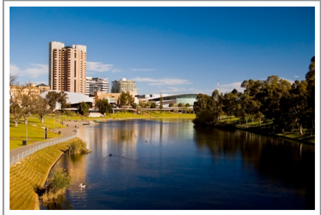
Adelaide on the banks of the Torrens River

The conference will commence with a PhD and Early Career Researchers workshop on Tuesday 8th February. Delegates will be welcomed at a lunch on Wednesday 8th February followed by the official opening of the conference; the first day closing with a Welcome Reception. The conference will run until Friday 11th February and will conclude that night with the conference dinner which will give attendees the opportunity to celebrate CAUTHE's 21st birthday.