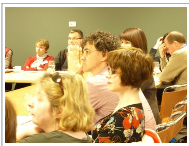
Members attending the MYM