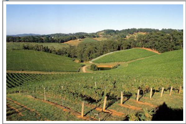
Lenswood Estate Winery in the Adelaide Hills

Go to http://www.fcconventions.com.au/CAUTHE2011/ for more information.